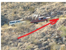
They Just Caught Something Nobody Was Supposed To See