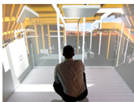
Nobody Expected This Announcement From Tech's Biggest CEO