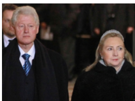
You'll Never Guess Who's About to Go Bankrupt