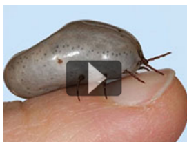
The Root Of All Stomach Problems?