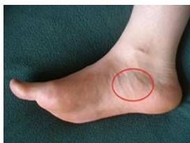
4 Stages To A Heart Attack