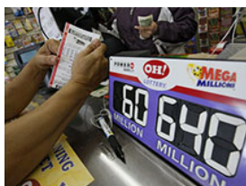
Lotto Winners Do This Before Buying A Ticket